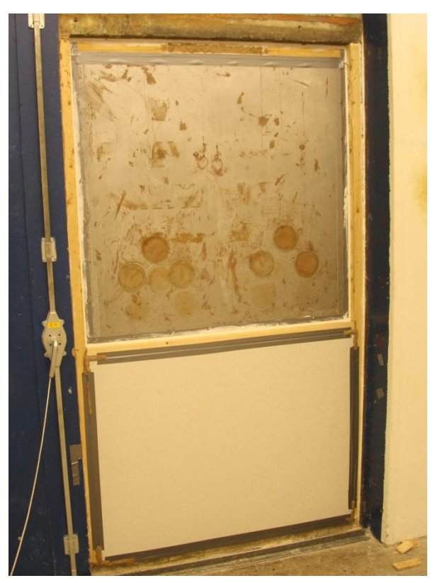
Figure 1 – The receiving room.