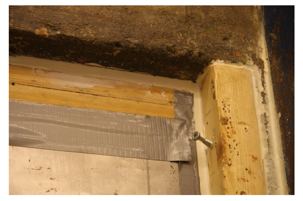
Figure 4 - The sealant applied to the gap.