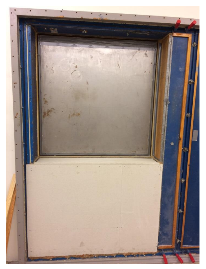
Figure 2 - The sender room.