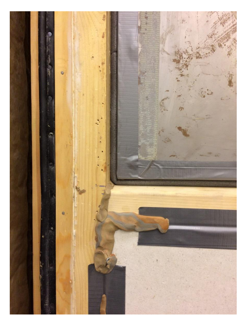
Figure 3 - the backing rod applied to the gap.