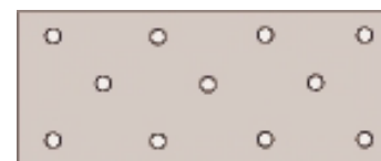
40 x 2,0/3,0 mm Ø5,0

* Check the number of nails required. L = In stock, D = Direct delivery, 4 week delivery time.